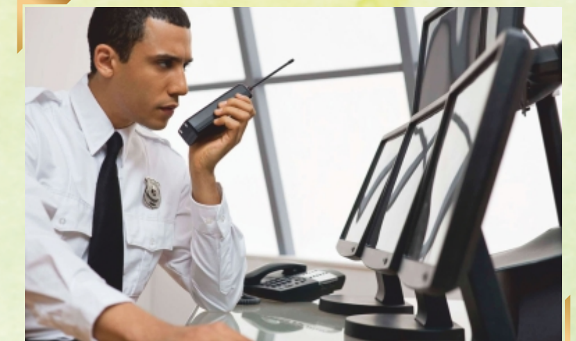
24 x 7 Security