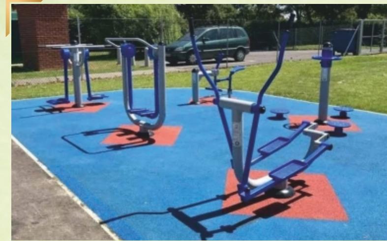
Outdoor Gym Area