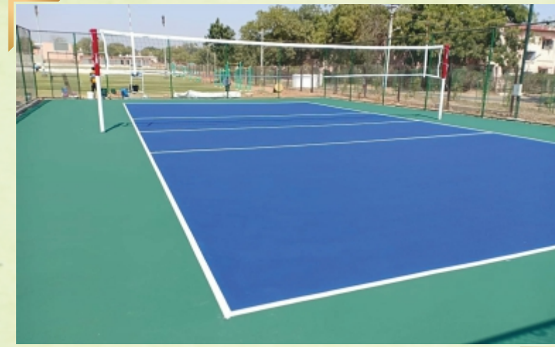
Volley Ball Court