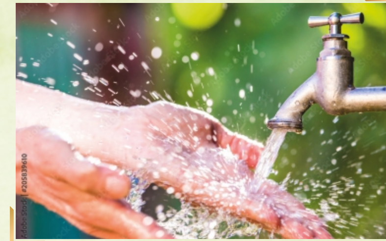
Individual Pipe Line