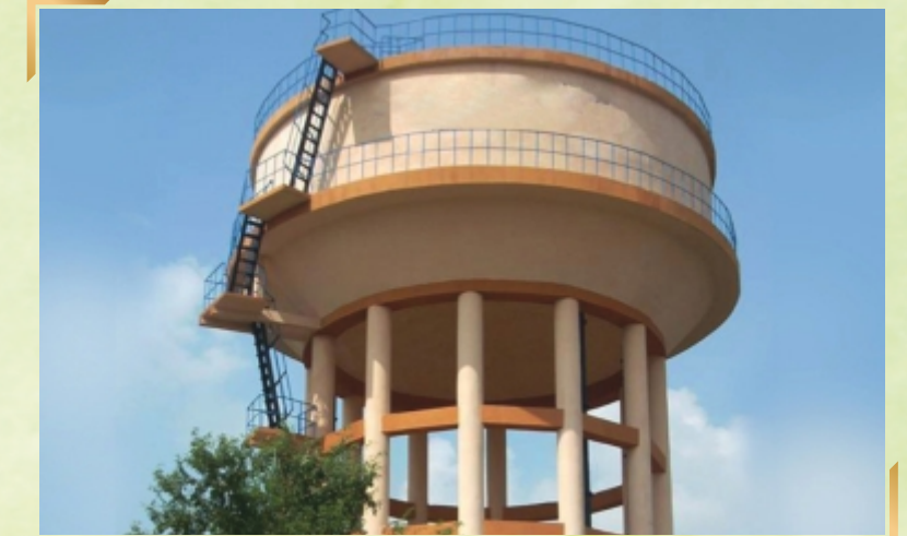
60K Litre Tank